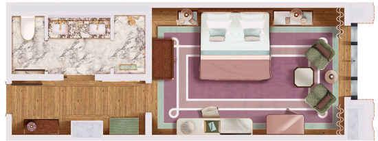
DELUXE KING/DELUXE DOUBLE QUEEN