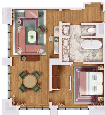
HUDSON VIEW CORNER SUITE