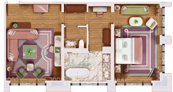
TRIBECA CORNER SUITE