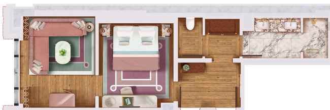
PRESTIGE JUNIOR SUITE